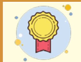
Page 9 Team BOGS FOGSI Prizes