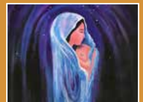
Page 10 BOGSCON 45